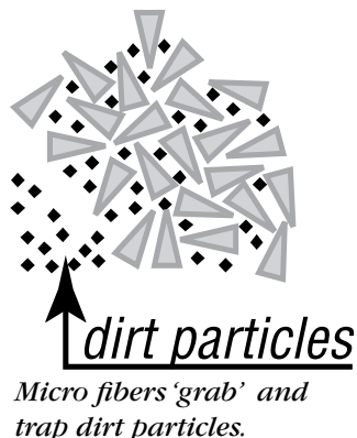
Micro fibers 'grab' and trap dirt particles.

2.) Split filament microfibers are softer than cotton. The following micro photograph shows a painted surface that has been rubbed with microfiber (left) and cotton (right).